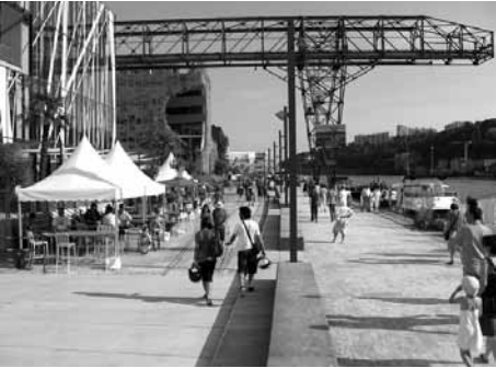
The Docks of Lyon