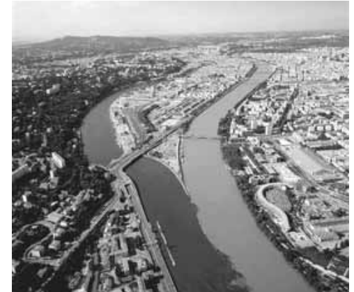
© Jacques Leone - Grand Lyon